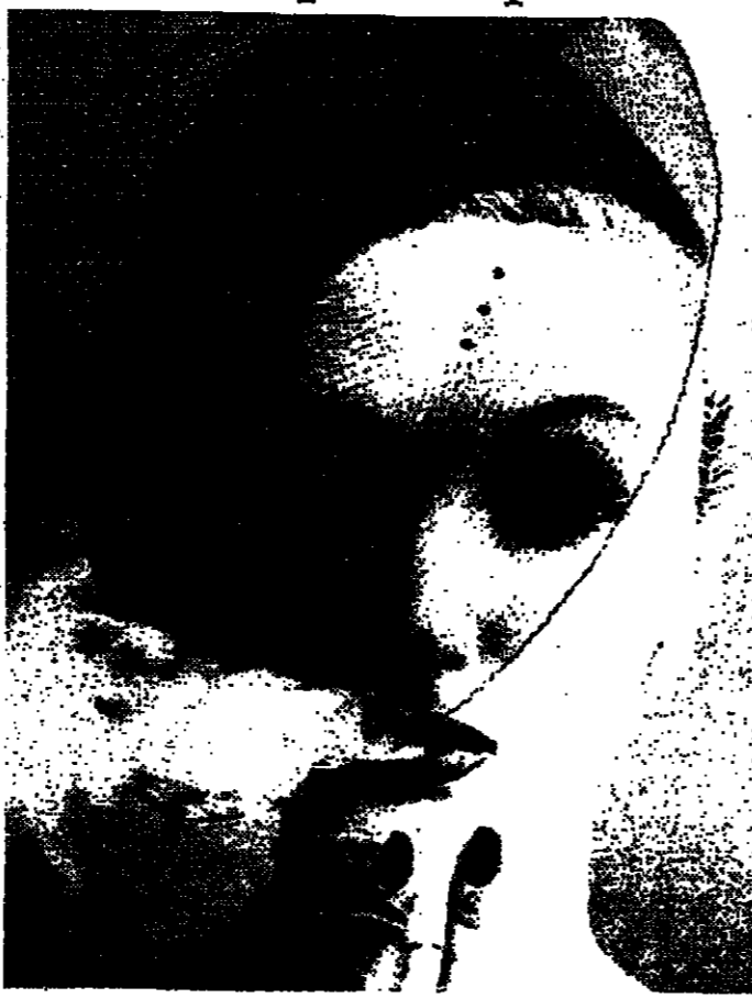
Klein fashion photo for Vogue in 1958.

er." In the camera he found an ideal tool. "I was fascinated by it, especially by what were considered blurred pictures, over-